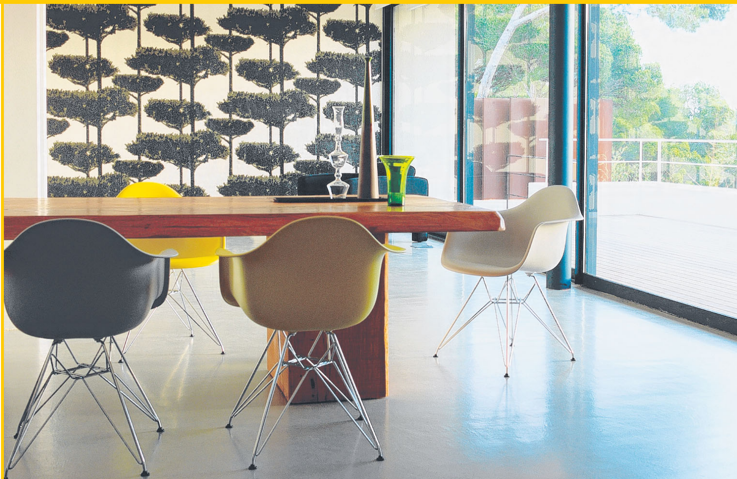
Iconic design Vitra Eames DAR Plastic Armchair with Eiffel base, from $564, InnerSpace, www.innerspace.net.au .

Jazz It Up Home & Giftware, Shop 1, 18-22 Hurtle Pde, Mawson Lakes 8162 9279.