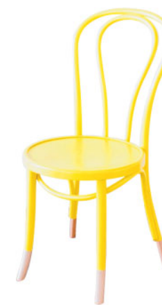
Bright burst GUBI Chair /1 by Komplot, from $730, Aptos Cruz Galleries, 147 Mount Barker Rd, Stirling 8370 9011, www.aptosacruz.com .